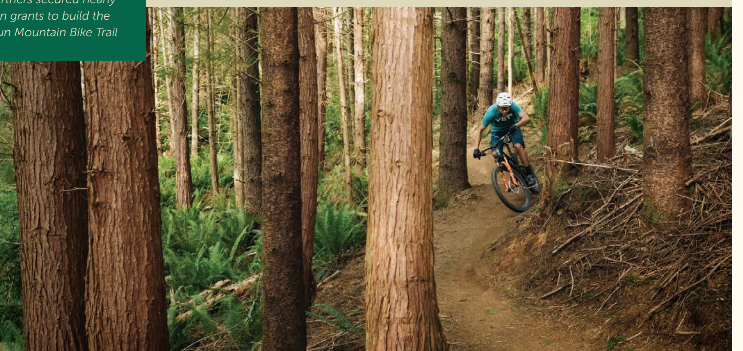
TSOC & partners secured nearly $1 million in grants to build the Whiskey Run Mountain Bike Trail

Produced a regional tri-fold brochure and 5 beautiful printed itineraries. These are used at consumer travel shows, media pitches, travel